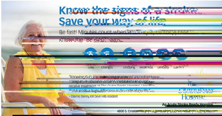
Advertising was also part of the BE FAST community education efforts for The Outer Banks Hospital